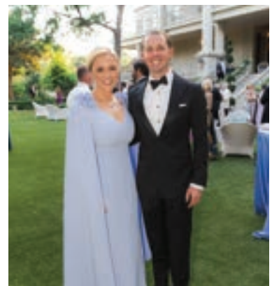
Featured cover and right: Enchantment of Spring Gala