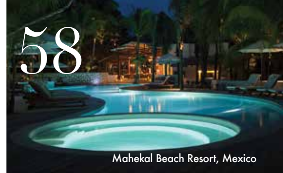
Mahekal Beach Resort, Mexico