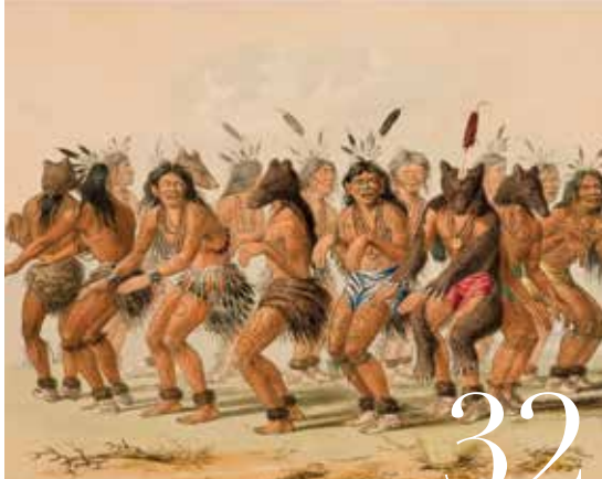
Briscoe Museum, San Antonio