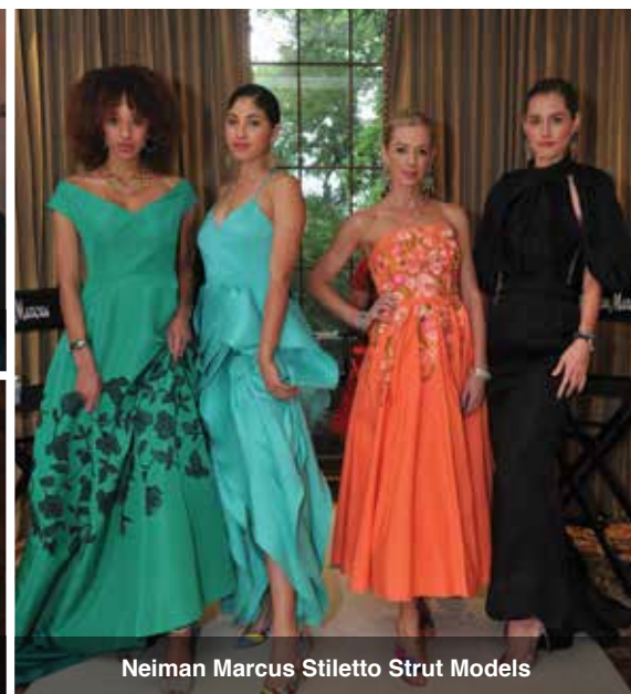
Neiman Marcus Stiletto Strut Models