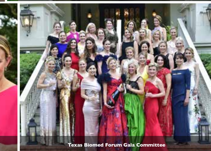
Texas Biomed Forum Gala Committee