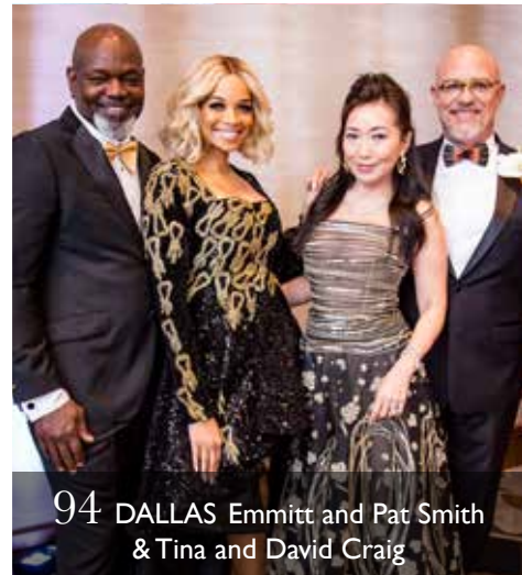
94 DALLAS Emmitt and Pat Smith & Tina and David Craig